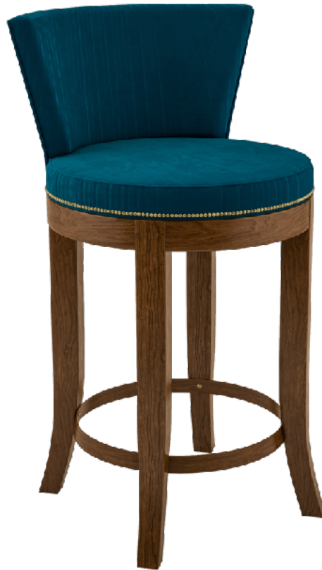
Vega Counter Stools